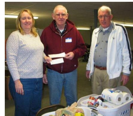
Monthly Donations to Food Pantry